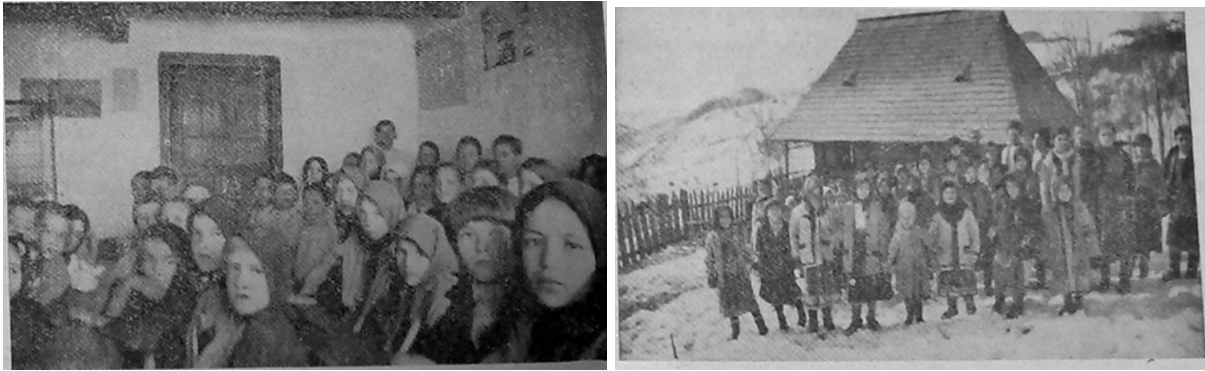
Picture 1. The difficult situation of schools and students in Berehivschina, Volivschina, Rakhivschina, Khustschina in Pidkarpatska Rus, the early twentieth century (Agij, 1935)

There was a lack of school premises and teachers in the mountains as well. A large part of the schools were located in ordinary peasant houses. It happened, as, for example, in the Mizhhirya region, that the educational process lasted only during the autumn-spring days, in nature – under oaks or spruces. It was difficult for children from villages scattered in the mountains and hills to get to school, so they did not attend school and had low grades (Picture 2).